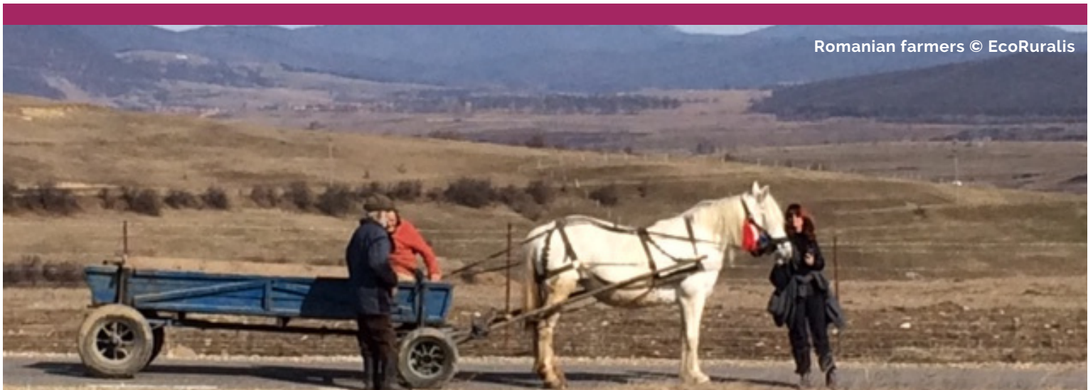
Romanian farmers